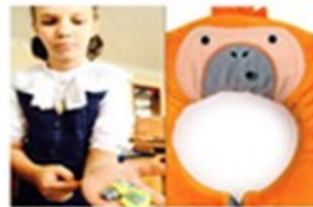
Cecilyk- Musteață Cecilia -Republica Moldova