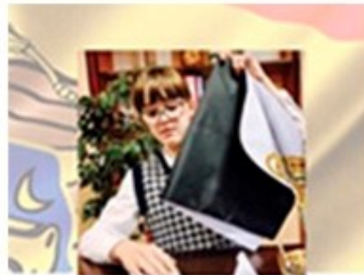
BUCA FELICIA - FELISPANDR, MOLDOVA